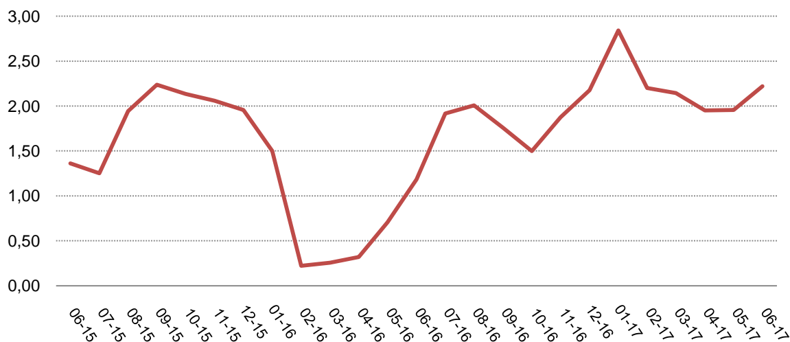
Fig. 1 Annual rate of consumer price index

Contribution of main groups in yearly changes of CPI: Annual growth rate in June was push up mainly from “Food and non-alcoholic beverage” group by +1.87 p.p.. Prices of “Housing, water, electricity and other fuel” group contributed by +0.19 p.p.. Prices of “Different goods and service” group contributed by +0.16 p.p.. Prices of “Alcoholic beverages and tobacco” and “Transport” groups contributed by + 0.04 p.p.. each of them. Prices of “Education service” group contributed by + 0.03 p.p.. Prices of “Recreation and culture” group contributed by +0.02 p.p.. Prices of “Communication” group contributed by +0.01 p.p.. Prices of “Clothing and footwear” and “Furniture household goods and maintenance” contributed respectively by -0.10 p.p. and -0.03 p.p.