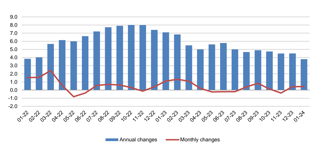
Fig. 1 Annual and monthly rates of HICP

In January 2024, the monthly rate measured by Harmonized Index of Consumer Price is 0.4 %. This was mainly influenced by the increased in prices of "Food and non-alcoholic beverages" group by 1.1 %, followed by "Furniture, household goods and maintenance" by 0.5 %, "Health" by 0.4 %, "Alcoholic beverages and tobacco" and "Miscellaneous goods and services" by 0.2 % each of them, "Recreation and culture" and "Hotels, coffee-houses and restaurants" by 0.1 % each of them. Meanwhile, prices of "Transport" group decreased by 0.2 %, followed by "Clothing and footwear" by 0.1 %.