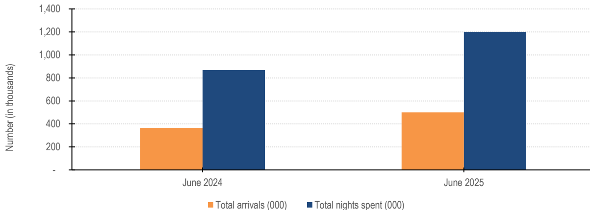
Fig. 1 Total arrivals and nights spent (000)